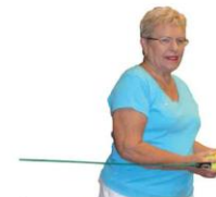
Side Oblique Hold arms close to body and rotate the waist.