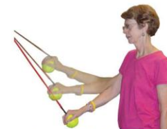
Downward Pulling Motion Keep arm straight while pulling straight back.