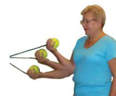
Bicep Curl Hold elbow to side and curl arm upward.