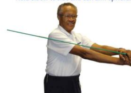
Lower Back Rotation Rotate waist line, keeping arms fully extended.