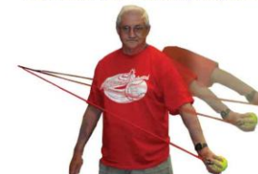
Lateral Lift Lift arm to side, Shoulder High.