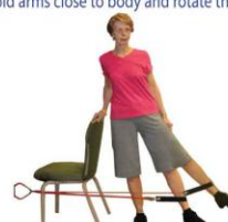
Multi-Hip Motion Extend leg straight out to the side, front, back or across.