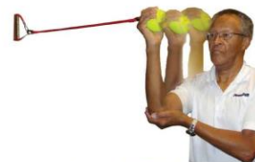
Rotator Cuff Workout Rotate Shoulder Downward while supporting arm.